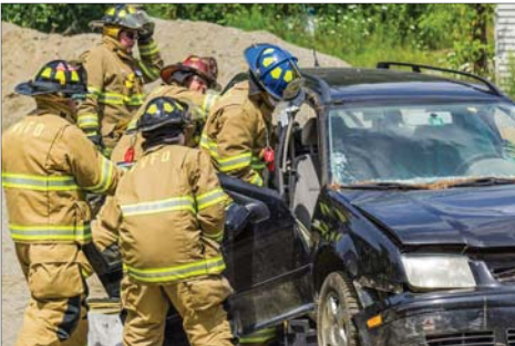
Wolcott Volunteer Fire Department (VFD) firefighters demonstrate how to extract an accident victim from a vehicle at the Wolcott VFD Open House.

Policy decisions such as limiting access to some dogs may be at the sole discretion of the library's board of trustees.