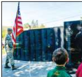
A group meets for a meeting on the Memorial and its new park area at its official opening and dedication on Monday, May 27.